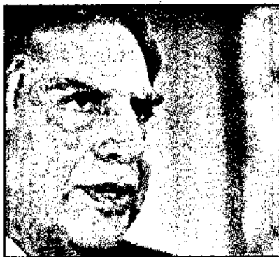
■ Tata group chief Ratan Tata